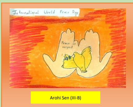
Arohi Sen (III-B)

Moral: Team work, cooperation, determination and dedication help us achieve the impossible.