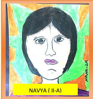
NAVYA ( II-A)